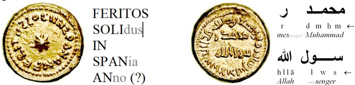
Fig. 5 Arabic-Andalus dinar with star dated 98 AH

98 AH corresponds to calendar year +717 EC, i.e. 755 EG. In the latin text on the obverse side of a dinar minted that pretty year, presumably in order to avoid confusion among the Visigothic subjects, the year is not specified (see Fig.5).