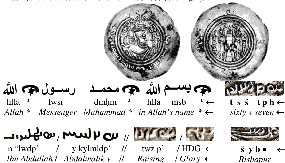
Fig.4 Arabic-Sassanian dirham dated 67 AH Clavier virtuel: https://www.lexilogos.com/keyboard/arabic.htm

To complete this discussion of the genesis of AUC & AD Calendar Eras, we turn now to the AH Calendar Era. Hijri dates appeared on coins some years after the Muslim tribe's migration from Mecca to Medina. The rear of this migration was claimed to have been brought up, on +622.07.16 CE, by the "Prophet Muhammad, Allah's Messenger". The 1 st dated reference to this Messenger, its "birth certificate", appears on the obverse side of a coin, minted by Governor Abd al-Malik ben Abdallah in Bishapur (Persia), in year 67 AH. In addition to the name of the Governor, this dirham carries the effigy of Shah Khosro II. Written from right to left , the bilingual texts are in Pahlavi and Arabic, the transliteration follows DIN 31635 (see Fig.4).