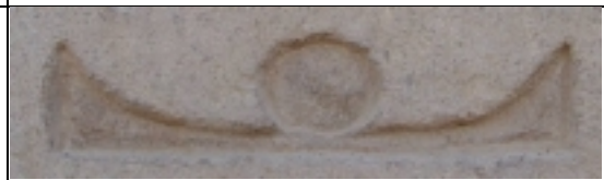
10. Hieroglyph Akhet meaning "Horizont" but also "Genesis of Time".