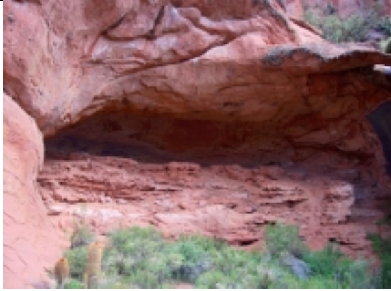
1. Cueva de las Momias, from Rio Chulin