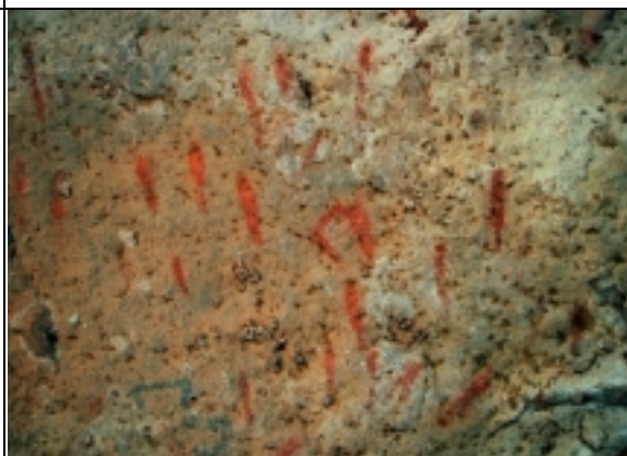
6. Red strokes Rock Art on the walls of the Cueva de las Momias