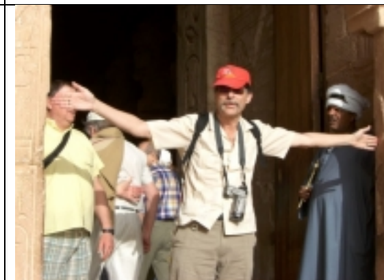
12. Measuring the entrance of the 65 m long corridor at Abu Simbel main Temple.