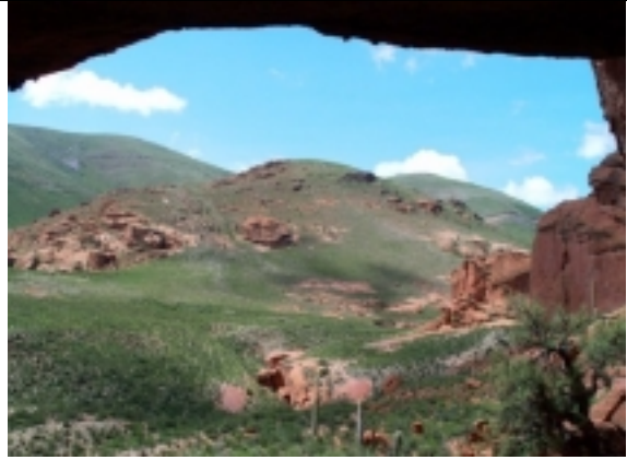
2. View from the Cueva de las Momias