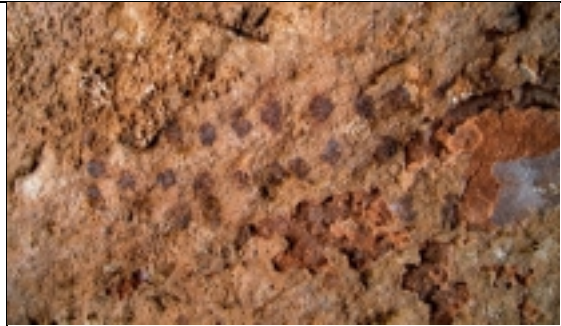
8. Ochre dots Rock Art on the walls of the Cueva de las Momias