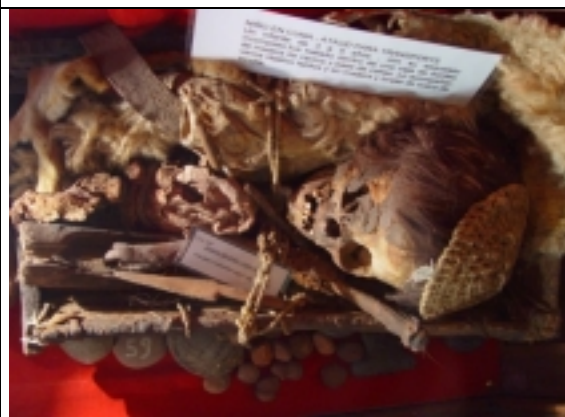
5. Naturally mummified young child found in 1936 in la Cueva de las Momias