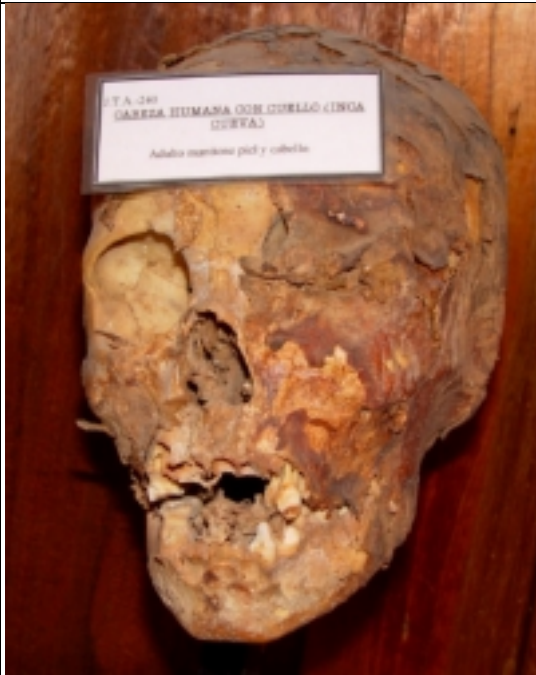
3. Naturally Mummified Head J.T.A. 240 found in 1936 in la Cueva de las Momias