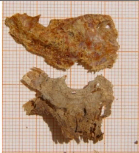
4. The two small sample of the left temporal skin, 120 milligrams each